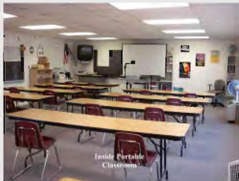
Inside Portable Classroom