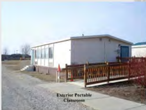
Exterior Portable Classroom