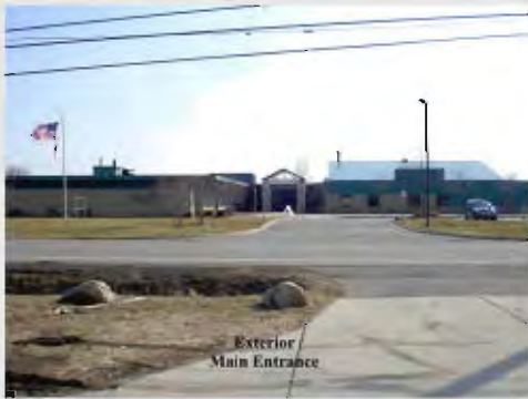
Exterior Main Entrance